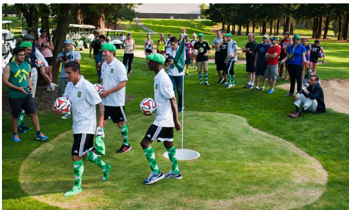
Australian football icon Tim Cahill leads his teammates off of the green after a birdie.

Not familiar with the sport? Check it out on youtube under 'Foot Golf Promotional Film'.