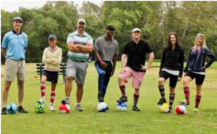
For old and young, male and female.

There was a demonstration day on Sunday 14 th of February and the official opening will be in March.