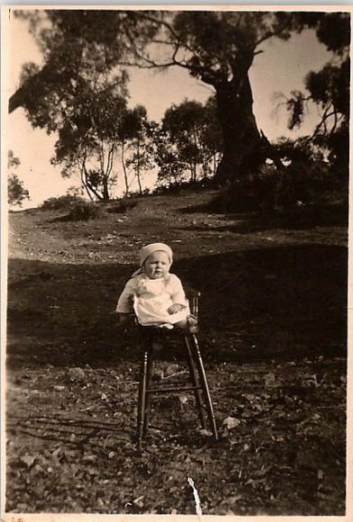
A very young Hazel.

The reporting of aeroplanes occurred with 'air flash calls' and these calls were put through to Adelaide in a matter of seconds, with a description of the plane, a location and a special number, to verify your call. Once rostered on you could not leave the post until a person arrived to take your place. As a volunteer you were expected to be able to