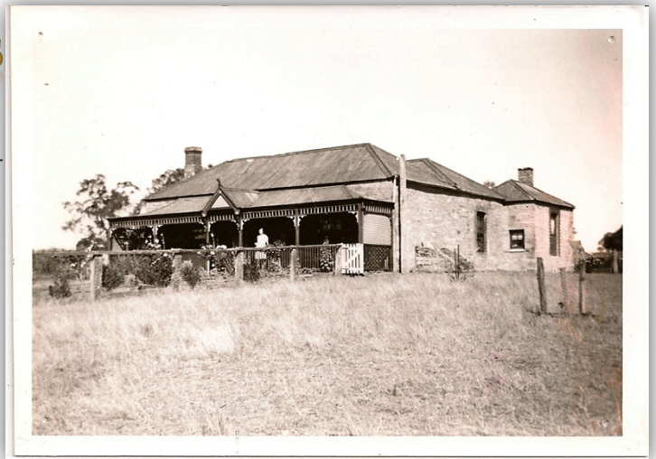
'Updown Park' - the Deane family farm.