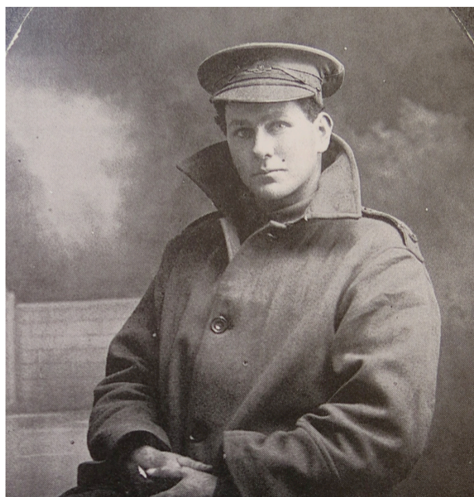
The Advertiser (Adelaide, SA : 1889 - 1931) Thursday 24 August 1916 p 8 Article