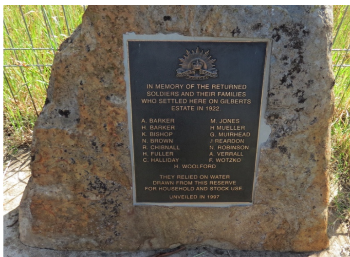
The Rhine Water Reserve Memorial