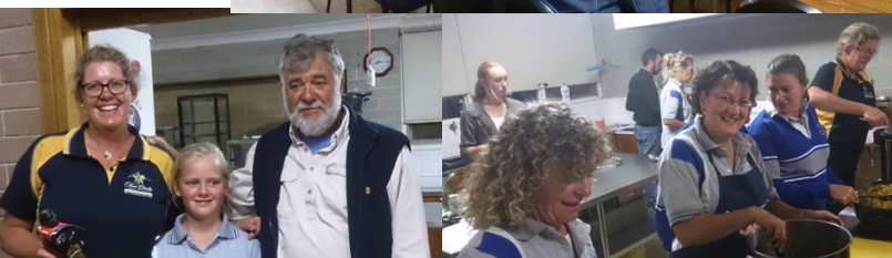
(Above) This month's Community Dinner was catered for by the Pony Club, and the Torrens Valley FC provided the drinks. That new pavilion kitchen is getting closer!